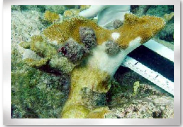
Coral-eating snails covered in algae feed on elkhorn coral tissue.