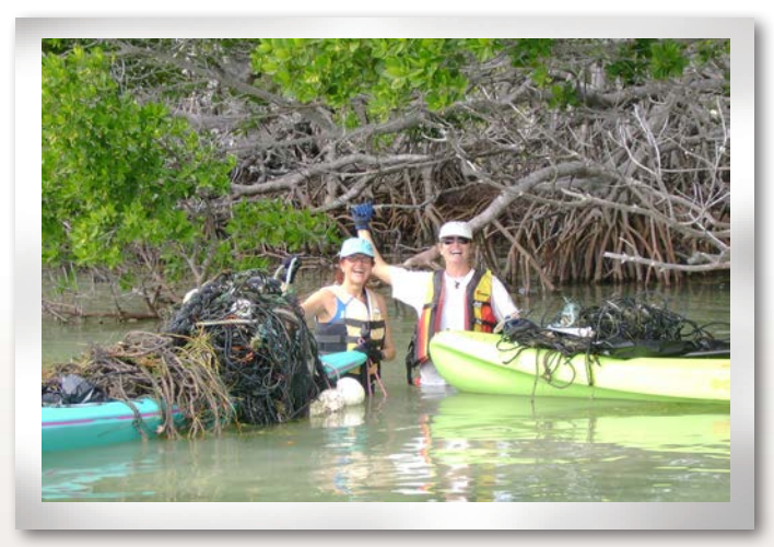
Team OCEAN volunteers use kayaks to collect marine debris.

Coral researchers from Nova Southeastern University (NSU) Oceanographic Center (formerly with University of North Carolina Wilmington) began conducting Keys-wide surveys of marine debris in 2000 during their assessments of corals, sponges and other benthic (bottom-dwelling) marine life. Since