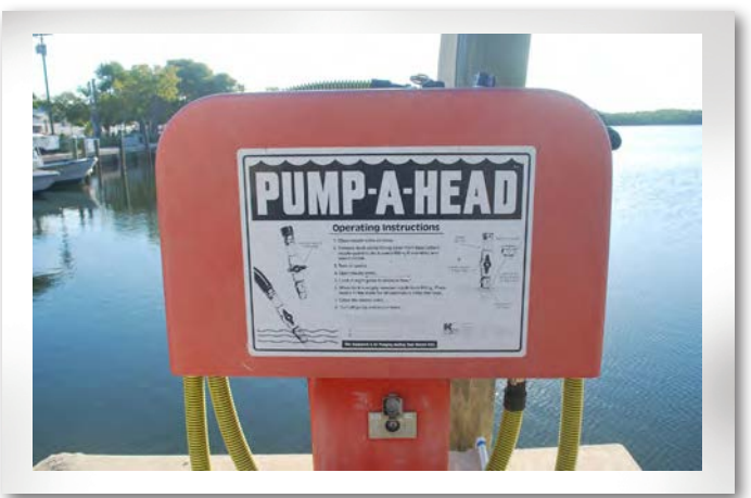
Vessels are required to dispose of sewage at pumpout stations on land.

The Seagrass Monitoring Project uses a variety of methods to track the condition of seagrass and other benthic plants in the sanctuary. One method involves analyzing seagrass leaves for their nutrient concentrations. Leaves are good indicators for nutrients in the water column because as the plant grows, it absorbs nutrients from the surrounding water. Nutrient enrichment can lead to the degradation or loss of seagrass habitat. Under such conditions, nutrient-loving plants like seaweeds are favored in place of seagrass. At this time,